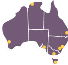
Laws that affect the state or territory