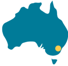
Laws that affect the whole of Australia

Visit your local government website to help your research.