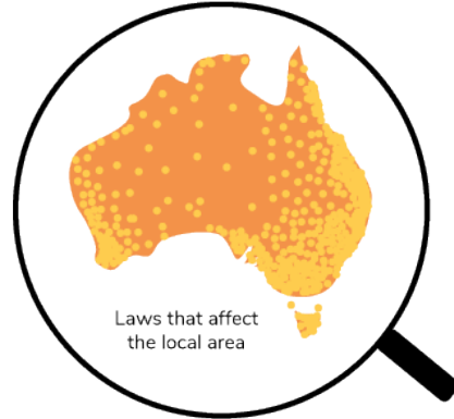
Laws that affect the local area

What is the name of your local council/shire/government? _____